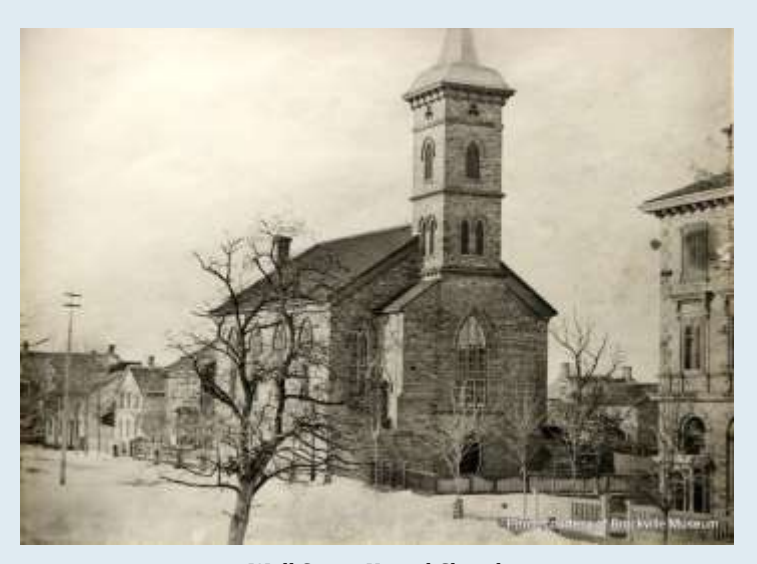
Wall Street United Church

Designation does not prevent the introduction of modern conveniences. It is perfectly acceptable to install central air conditioning, swimming pools, satellite dishes, garages, parking spaces, modern interior design treatments, etc. Designation is usually not about "if" such changes can be made, it's about "how" or "how best" – within the budget constraints and objectives of the property owners, factoring in the significance of the heritage attributes that might be impacted.