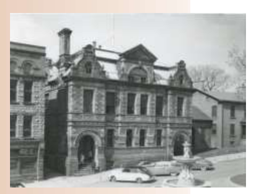
Post Office & Customs House

In Ontario, the conservation of cultural heritage resources is considered a matter of public interest. Significant heritage resources must be conserved. The Ontario Heritage Act gives municipalities and the provincial government powers to preserve the heritage of Ontario. The primary focus of the Act is the protection of heritage buildings, cultural landscapes and