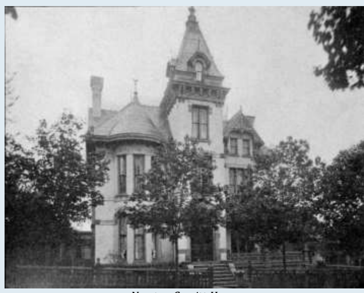
Newton Cossitt House

Designation does not affect property values. In-depth studies in Ontario and in other parts of Canada and the United States confirm that designation either has no negative impact on property values – or it increases property values. The conclusions of these studies suggest that people attracted to heritage homes are looking for the original heritage features to be intact. These buyers want a property with modern conveniences but not if genuine or vintage character is lost or has been slowly eroded by years or minor renovations or upgrades. Also, many heritage homes are located in established neighbourhoods that tend to further enhance property values.