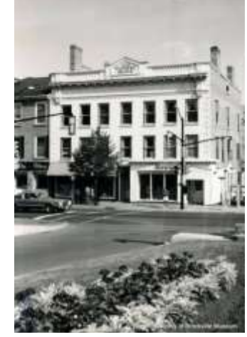
Jones Harding block

Council prefers to designate properties with the support of the property owner. However, Council will use its discretion to designate a property without the concurrence of the property owner. In certain cases, the Government of Ontario may also designate a property if that property is deemed to be provincially significant.