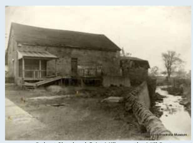
Robert Shepherd Grist Mill, now the Mill Restaurant

Designation does not prevent the redevelopment of a property. There are several instances locally where designated heritage resources and features are being sensitively adapted