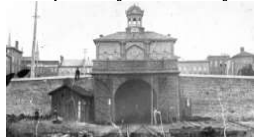
Brockville Railway Tunnel, Canada's Oldest Railway Tunnel

Design/Physical attributes include architectural elements such as: windows, chimneys, verandas, porches, doors, exterior cladding materials, decorative millwork and detailing, shutters, trim, stonework and any other structural features that are obviously old or original to the building.