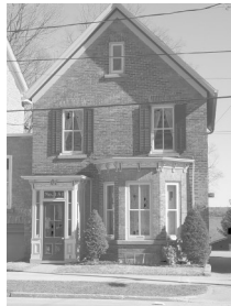
Example of a registered property in Brockville

The register is used to identify and document properties that may have cultural heritage value or interest to the community and to encourage their ongoing preservation and enjoyment. The register is updated on an ongoing basis to ensure it remains current and complete.